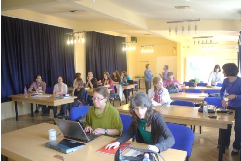
2 Language Coaches' Workshop

I recently got back from a conference in Budapest, and I wanted to share with you a little bit about one aspect of our work at the Centre for Lifelong Learning. The conference was a workshop for Language Coaches (those who help a new intercultural worker in their learning of language and culture),