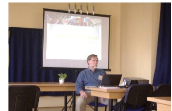
4 exploring culture website

There were about 20 of us from at least 14 countries around Europe, the Middle East and Africa. The participants came from several organizations, and their roles