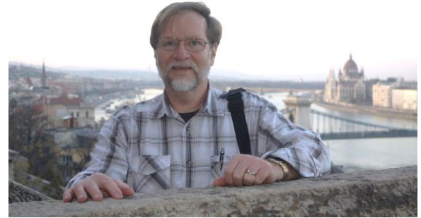
1 Overlooking the Danube, Budapest

given by the Institute for Cross-Cultural Training, a part of Wheaton College.